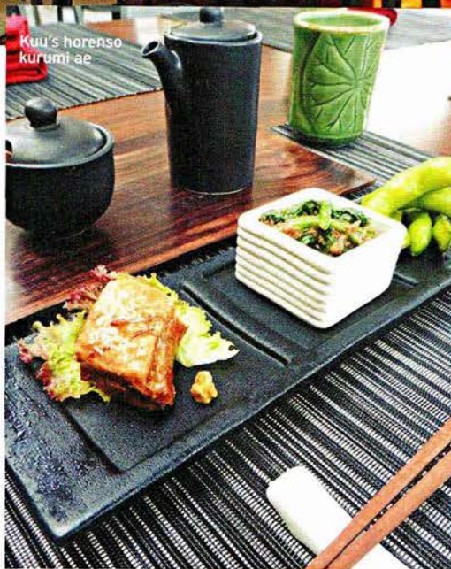
Kuu's horensō kurumi ae

There's a little bit of Kyoto in Sanur. At Kuu , small plates and light bites brimming with innovative and classic Japanese flavours are the main event; while polite service and a display kitchen form the delicate trimmings. For lunch, this izakaya offers familiar fare: bento boxes, noodles and rice bowls. During dinner, otsumami like Goma Dofu (Rp 30,000)